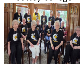
NE P.E.O. Home