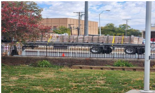
New Roof Tiles Arrive