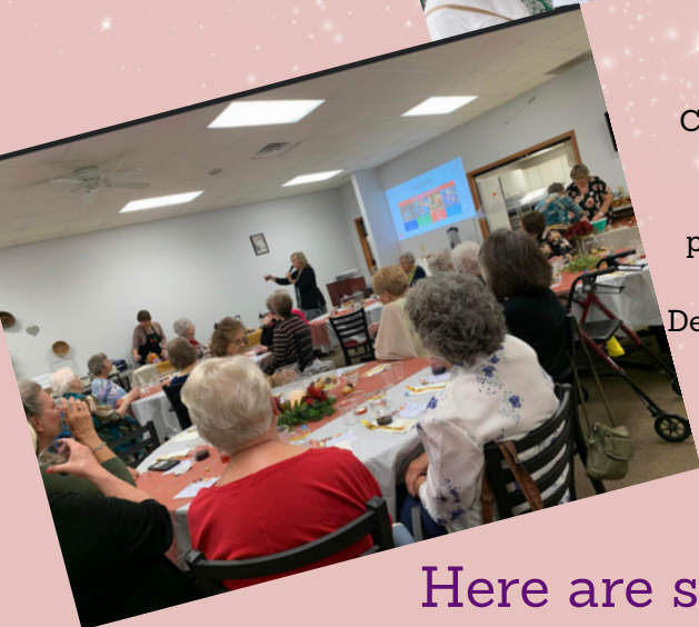
Chapter CQ-Neligh hosted the annual P.A.C.K.(Pierce, Antelope, Knox Counties) picnic. They had a charcuterie board

Demonstration and wine tasting with 60 sisters attending.